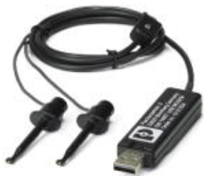
USB HART modem cable for communication between a PC and HART devices, cable length: 1m.

Please be informed that the data shown in this PDF Document is generated from our Online Catalog. Please find the complete data in the user's documentation. Our General Terms of Use for Downloads are valid ( http://phoenixcontact.com/download )